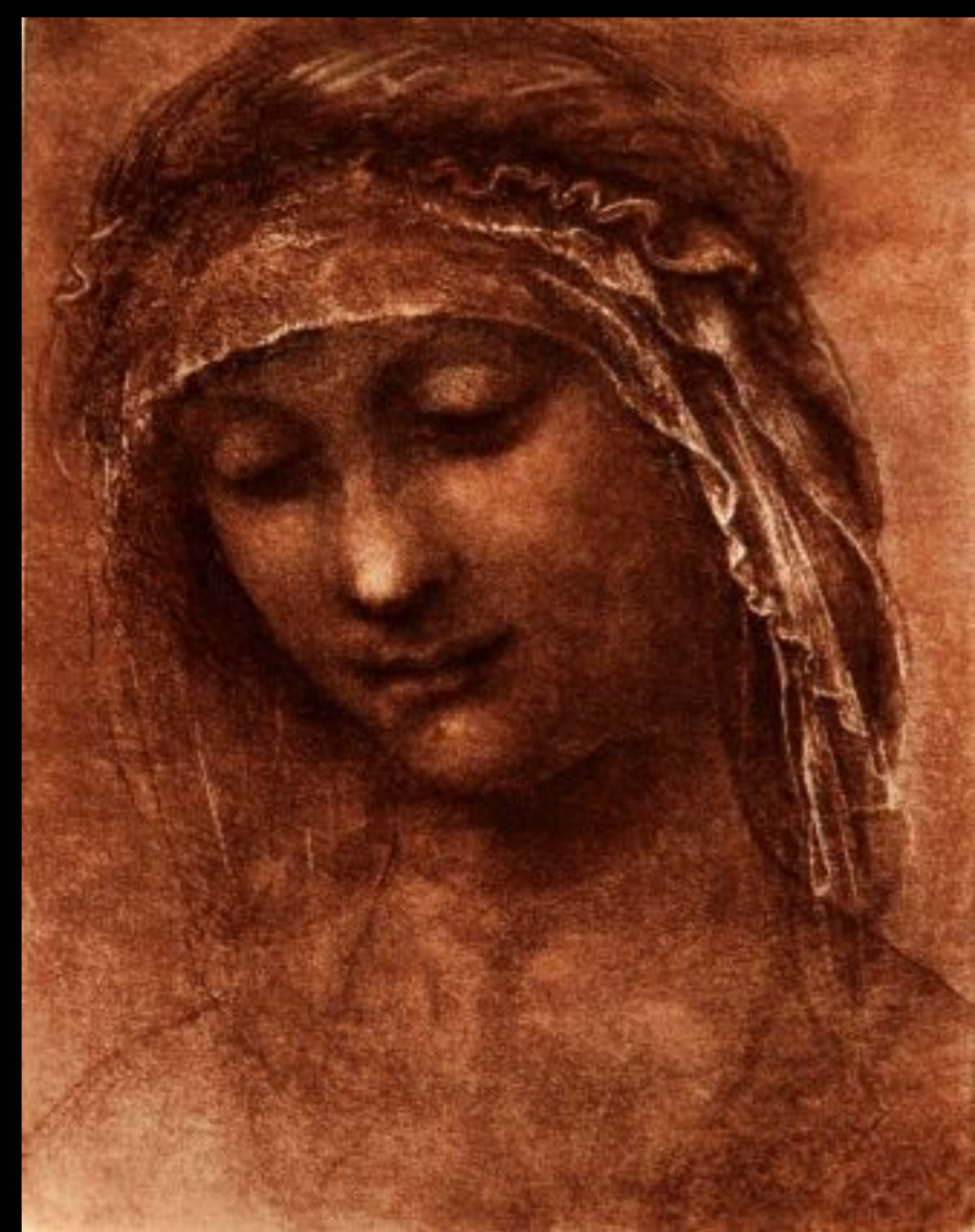
Leonardo da Vinci, Head of a Woman Three-Quarters to the Left . (1452 - 1519)

One reason that it is necessary is that it provides the categories for dealing with issues like the marriage of Jesus. Granted, Jesus did not marry. Nevertheless, Dan Brown’s hypothesis in The Da Vinci Code forces us to ask whether He could have married, or whether a married Jesus would completely destroy Christianity as it now exists. Now that we have examined briefly the New Testament teachings about Jesus Christ, we are in a position to answer that question. X