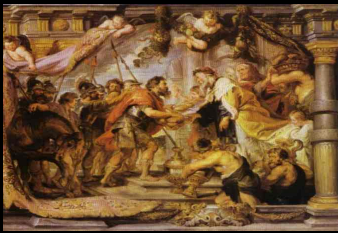
Peter Paul Rubens. The Meeting of Abraham and Melchizedek. (c.1625).

For nothing in Hebrews 7 is really new. Everything in that chapter is inferred from three sources. The first is the Genesis record about Melchizedek, a three-verse snippet of narrative (Gen. 14:18-20). The second is a single verse (Ps. 110:4) from a Messianic psalm. The third is a general knowledge of the history and culture of Israel.